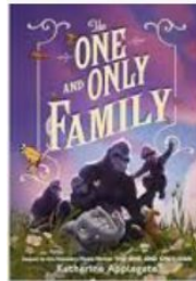
The One and Only Family By: Katherine Applegate

Dive in to one last adventure with Ivan, who is living happily in a wildlife sanctuary. Soon, he and Kinyani will navigate the joys and challenges of parenthood with their twins.