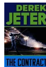
The Contract By: Derek Jeter

Eight-year-old Derek dreams of being the starting shortstop of his favorite team, the New York Yankees, but he has to get through Little League first! Derek faces the challenge of being a leader on and off the field while striving to be a champion.