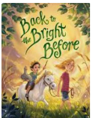
Back to the Bright Before By: Katherin Nolte

A magical adventure about two brave siblings determined to find a treasure that could save their family.